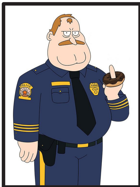
Randall from Paradise Police, 2018

HE IS 40 YEARS OLD, HAVE A MUSTACHE, IS OVERWEIGHT AND HAVE A BAD PHYSIC CONDITION.