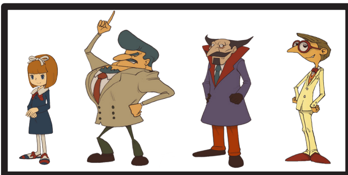
Professor Layton characters, 2007

IT'S AN ANIMATED SERIES, WITH CHARA DESIGN LIKE PROFESSOR LAYTON , AND AN AMBIANCE AND COLORIMETRY LIKE LES TRIPLETTES DE BELLEVILLE .