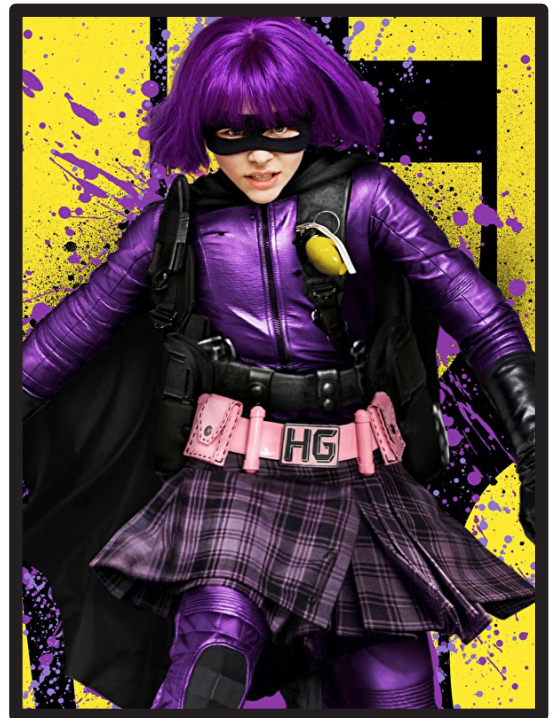
Hit Girl from Kick Ass, 2010

SHE HAS BLACK HAIR AND WEARS A MORE TRADITIONAL SUPERHERO COSTUME, WITH A BANDANA ON HER FACE. HER EYES GLOW RED IN THE DARK.