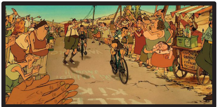
Les Triplettes de Belleville, 2002