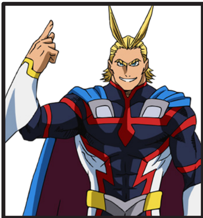
All Might from My Hero Academia, 2014